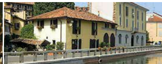
EL BRELLIN Alzaia Navigio Grande, 14, Milano