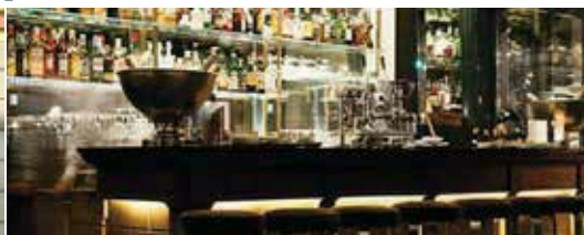
MIMMO MILANO Via Srtori, 34, Milano