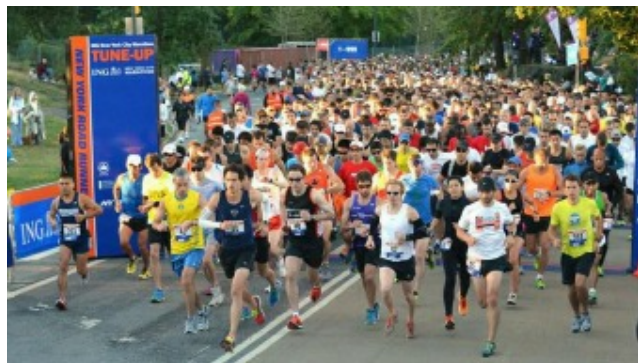
All Marathon in the World